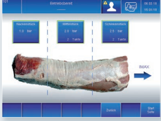
ACI - Area Controlled Injection