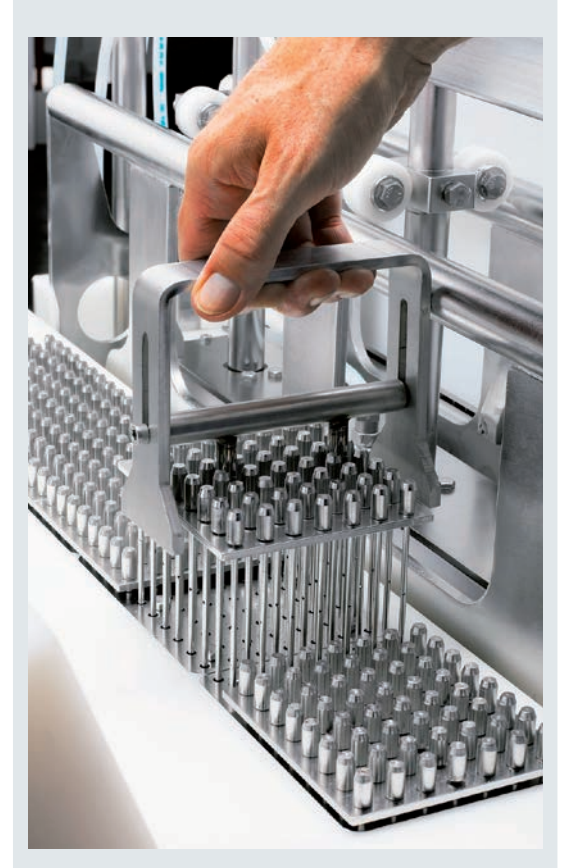
Needle removal tool

High-quality brine feed which is easy to clean.