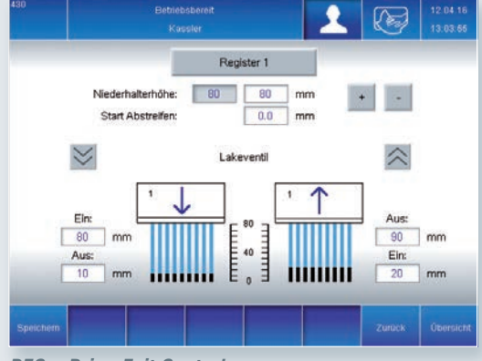
BEC - Brine Exit Control